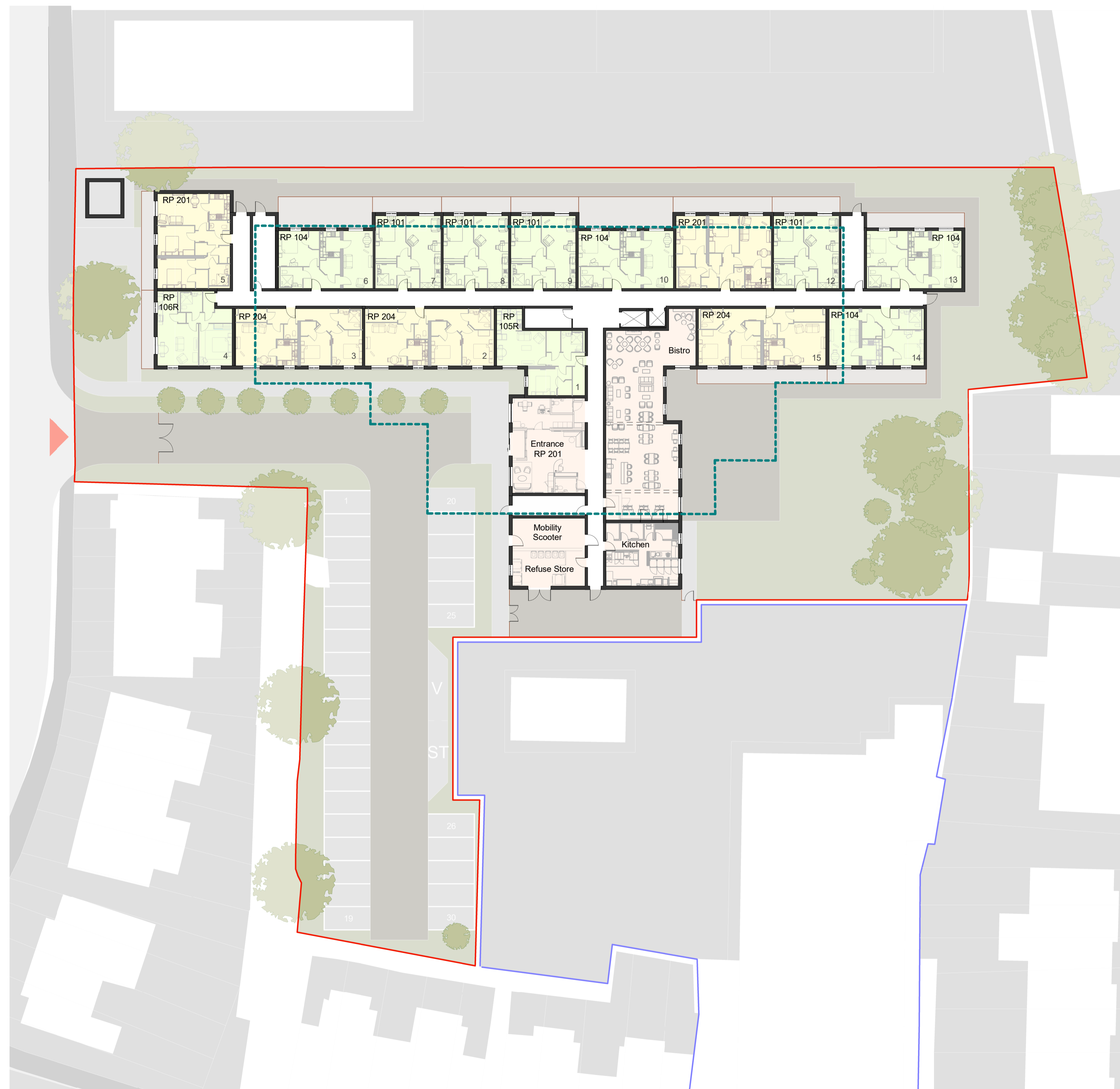
Ground Floor Plan Scale @ 1 : 250